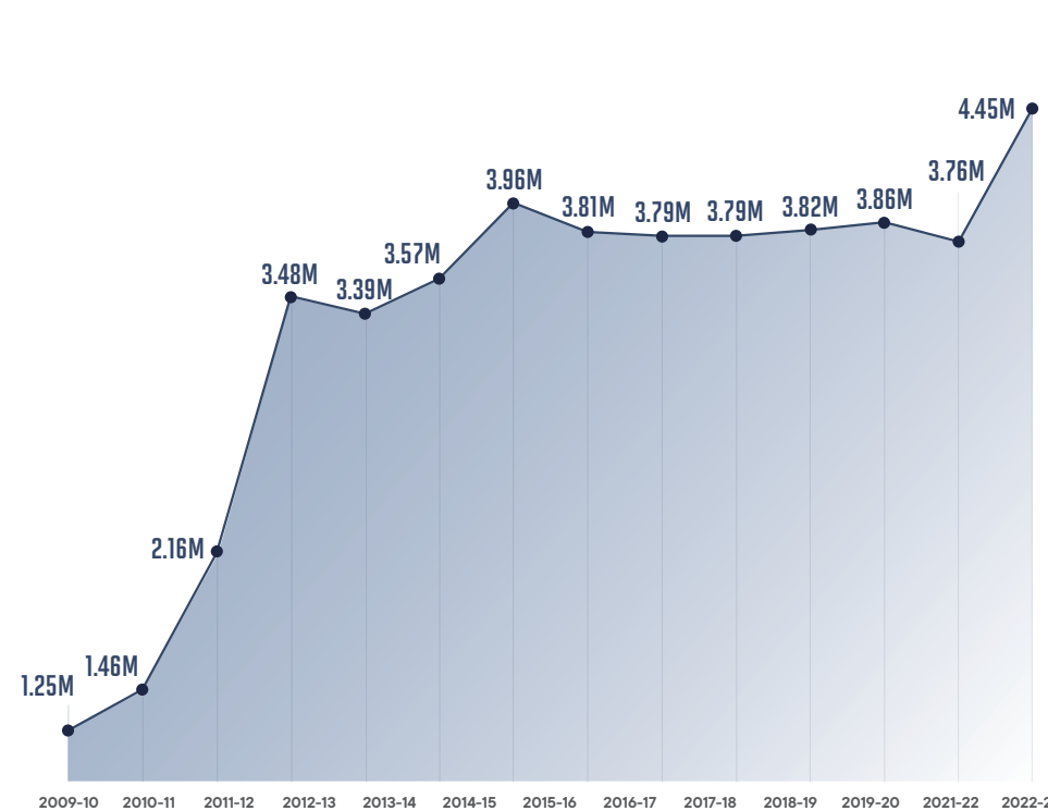
Total funds distributed per fiscal year since inception